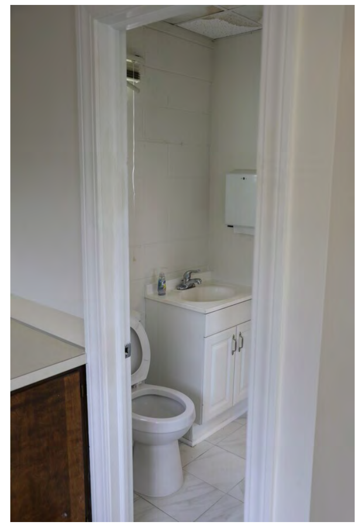
Separate Office Bathroom