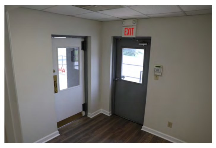
Lobby Entrance Foyer