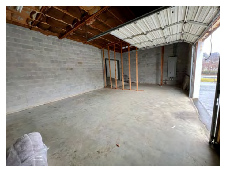
Ground Level Door Area