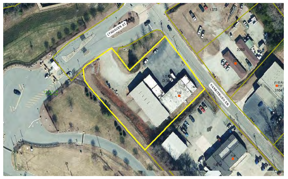
724 Harrisburg Dr. SW - Lenoir, NC 13,000 Sq Ft on 1.35 Acres