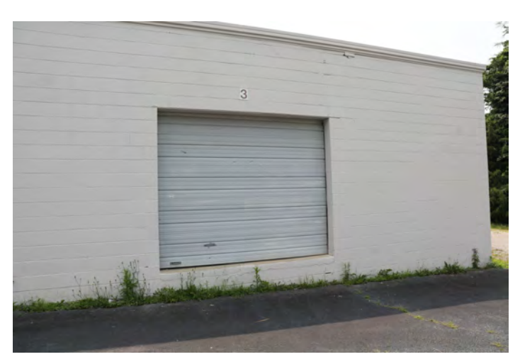
Warehouse Dock Door