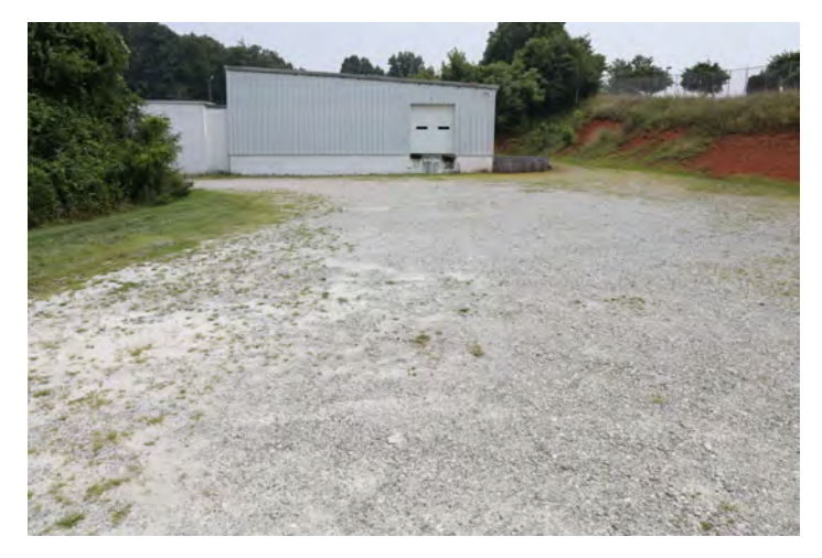
Dock Access Area